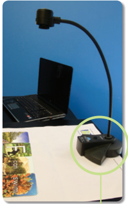
Camera placement Fig.1

Step 1: Verify that your computer meets the System Requirements listed on the back of the Letters alive box, or visit www.logicalchoice.com/lettersalive and go to the Current User Resources tab.