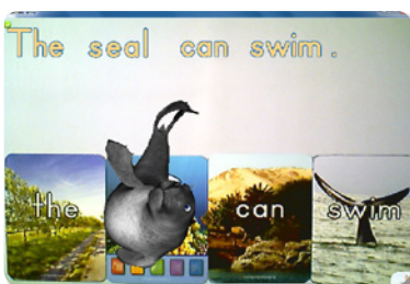
Letters alive ® Screen View