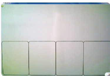
Ideal view from within Letters alive ® Fig. 3