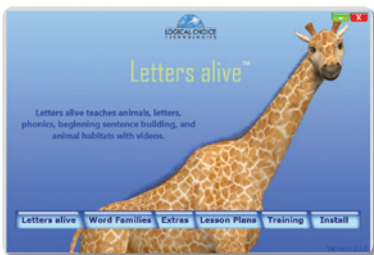
Letters alive ® Menu Interface Fig. 2

For more detailed installation and setup instructions, please watch the first training video on the Letters alive menu.